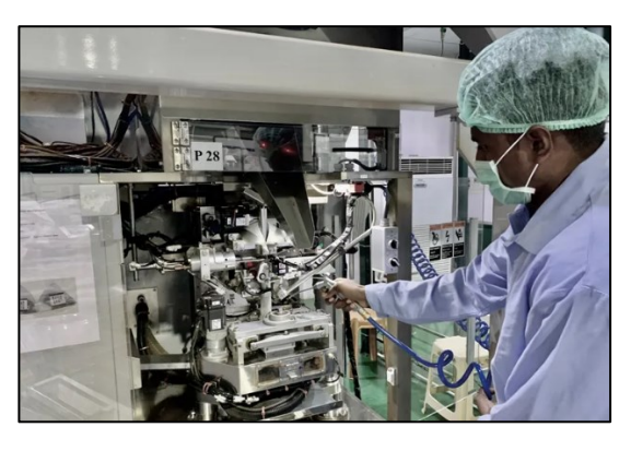
Tea packaging in constant struggle to perform.

Flower Tea Co<sup>*</sup> is a tea co-packer company that serves the major branded coffee shops chains. Production and Quality Assurance were frustrated with the new processes because they did not adhere to the established standards at launch.